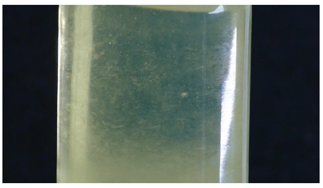
Wax crystals in untreated diesel fuel. The wax crystals will eventually fall out of solution and plug the fuel filter.