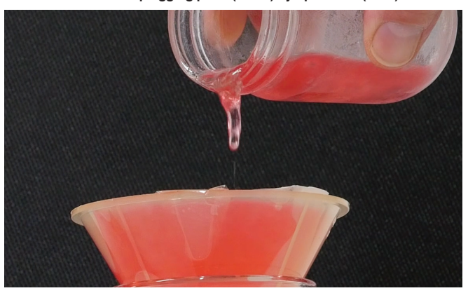
Wax formation in untreated diesel fuel resists pouring.

lowers the cold filter-plugging point (CFPP) by up to 40°F (22°C) in ULSD.