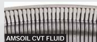
AMSOIL CVT FLUID