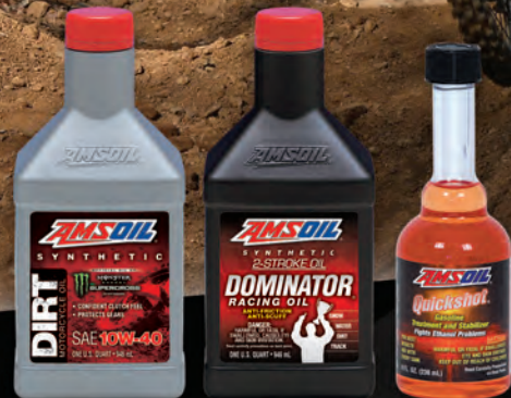
SYNTHETIC 4-STROKE OIL