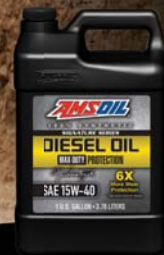
SYNTHETIC DIESEL OIL