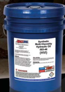
SYNTHETIC HYDRAULIC OIL