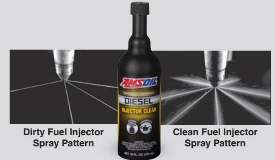
Dirty Fuel Injector Spray Pattern

Diesel Injector Clean also provides added lubricity, helping protect fuel pumps and injectors against premature failure.